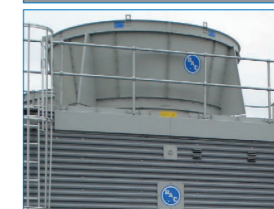
Velocity recovery stacks*