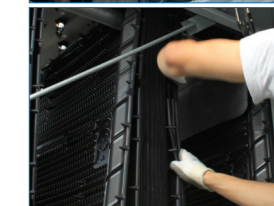
Patented BACross fill for sheet by sheet inspection and cleaning