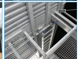
Internal service platforms*