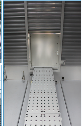
Inward swinging access door and internal walkway*