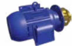
Spray pump without volute